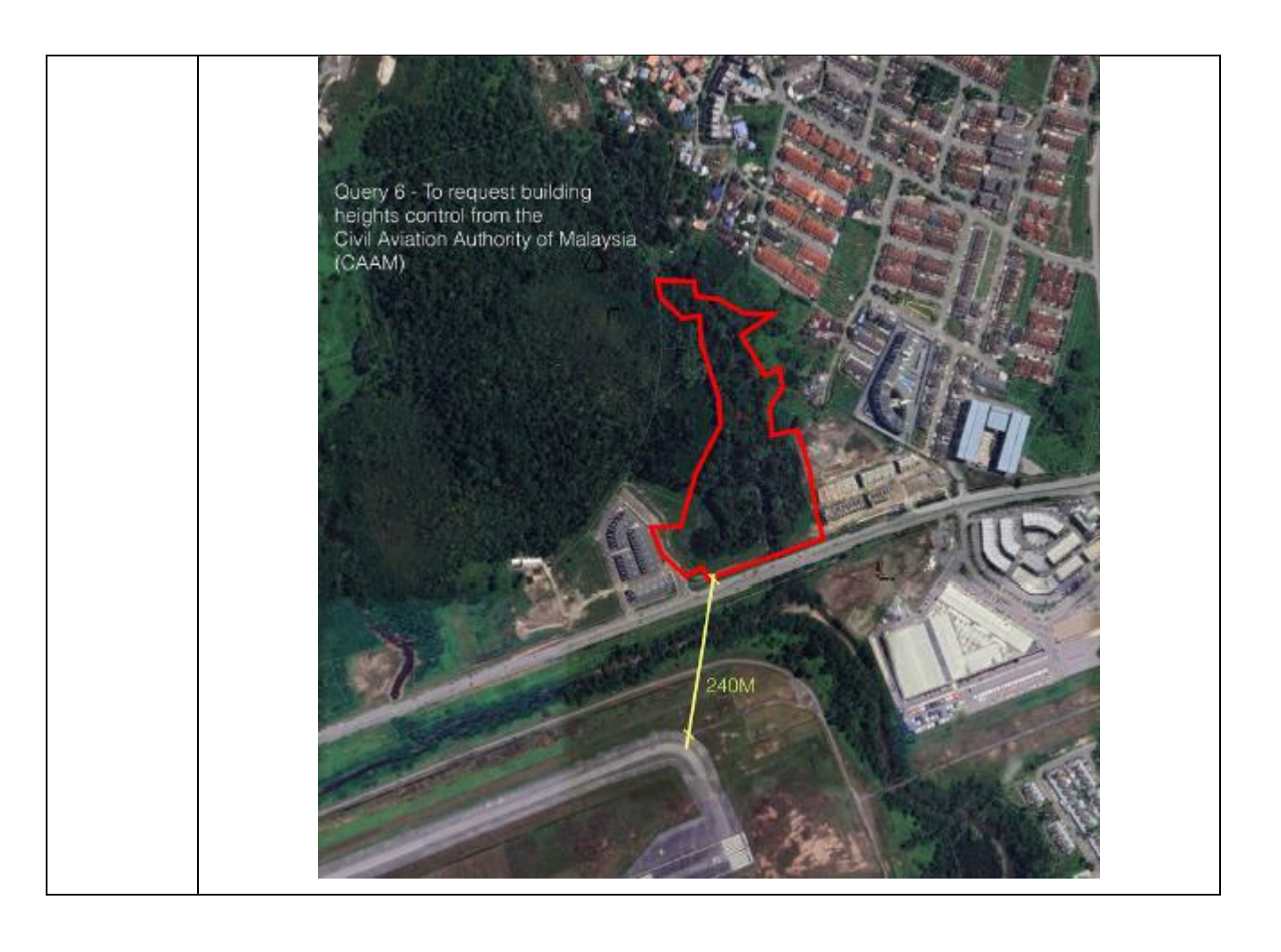
Prepared by: PAM-HSL AIR Architectural Design Competition Organising Committee 26 July 2024